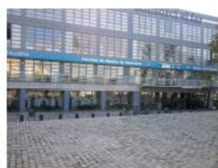
The entrance is on the right.